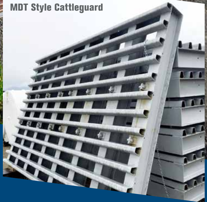
MDT Style Cattleguard