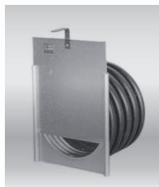
C2 HDPE mounting

Formed from extra-heavy prime galvanized steel and features die-formed seats which make the gate an excellent turnout when riveted into steel pipe, or when glued onto plastic pipe. The slide is held in position by spring-tension rolls, enabling the gate slide to be set in any position, easily regulating flow.