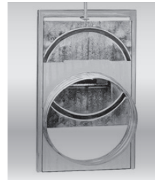
Detail showing seat C-8