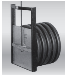
C8E HDPE Mounting