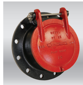
PF-25 flanged 125#