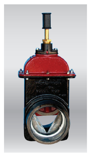
H-30 with V-notch opening