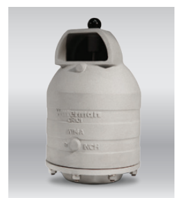
High Pressure Model