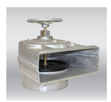
High Volume Dairy Flush Valve