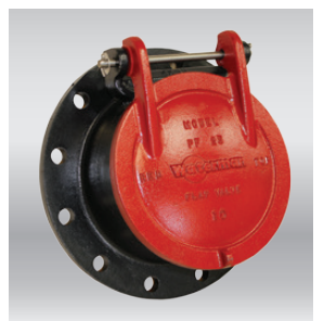
PF-25 flanged 125#