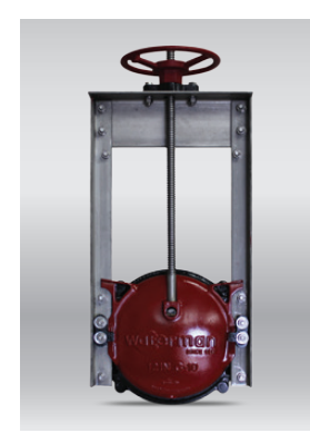
Model C-10 (12" size shown)