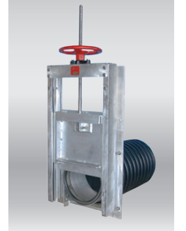
AC-31-Type 6 for HDPE