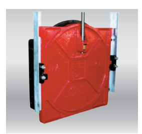
Model CL-10 Flat plate square bottom cover