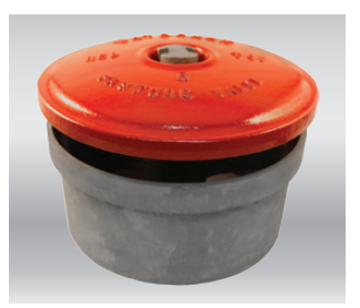
Pasture Acme Thread Standard