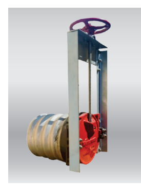
Gates can be fitted to metal and plastic pipe (different methods for each). Consult salesperson for best methods.