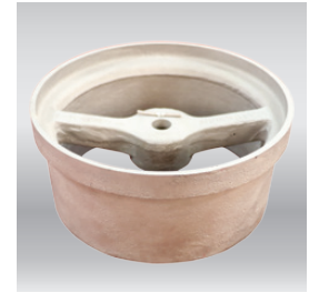
Type 4 (Plastic Pipe, Epoxy Fit)