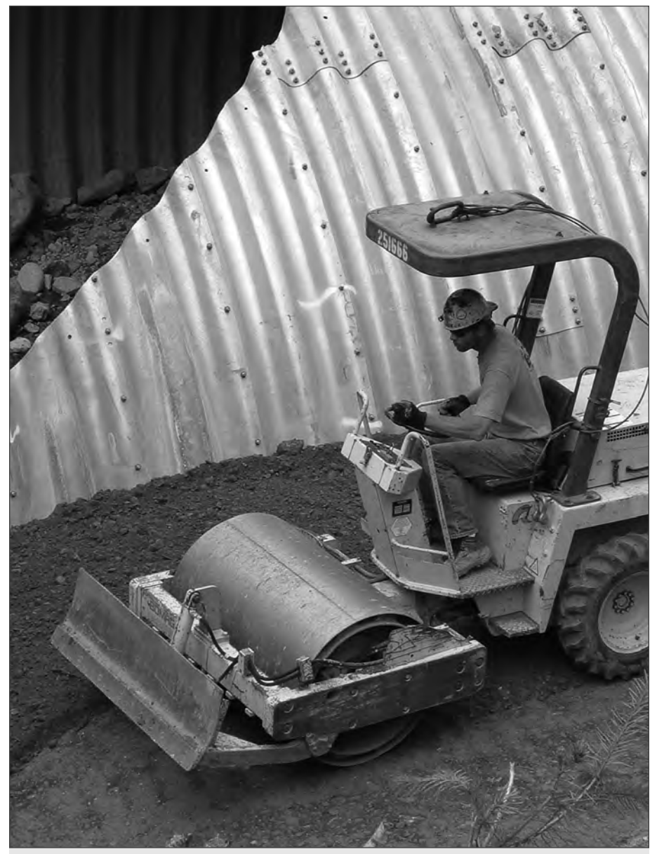
Proper backfill and equipment are important for a successful installation.